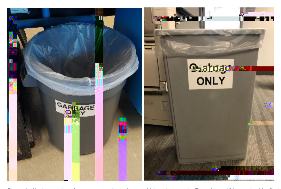
Figure 1. Waste container for non-contaminated general laboratory waste. These bins will be serviced by Custodial Services.