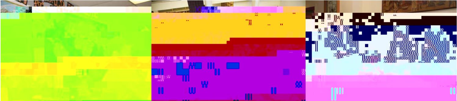
Table Tennis The Centre has table-tennis for all visitors and skates available for international students to borrow.

QUIC QUIC is active on both Facebook ( facebook.com/queenuniversity ) and Twitter ( twitter.com/queenuniversity ).